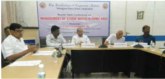
A View on Round Table Conference.

September 1, 2017: The Institution of Engineers (India), Telangana State Centre has organized Round Table Conference on "Management of Storm Water in GHMC Area" in light of frequent inundation of certain areas of GHMC during rainy season.