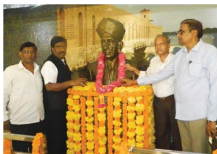
The Chairman, Hon. Secretary garlanding the statue of SIR MV.