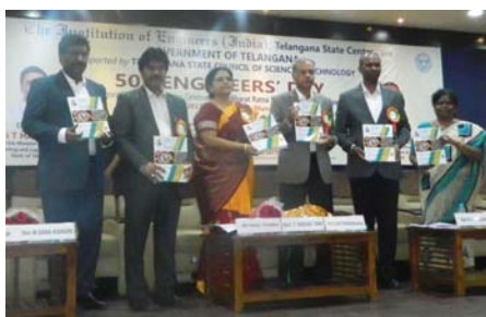
The Dignitaries Releasing the technical Volume