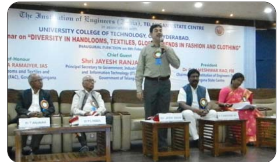
The Chief Guest addressing the gathering