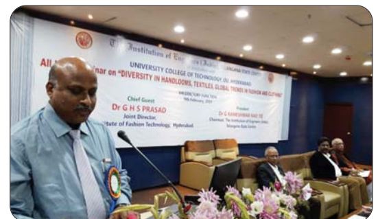
Valedictory Chief Guest addressing the gathering