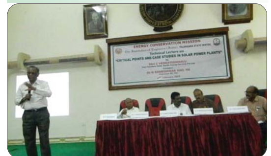
The Speaker delivering the Lecture

February 27, 2019: Energy Conservation Mission of IEI, Telangana State Centre was