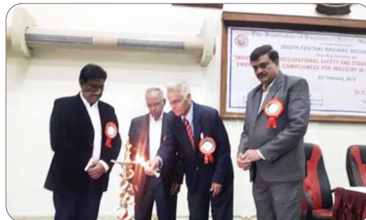
The Chief Guest lighting the lamp and dignitaries presented