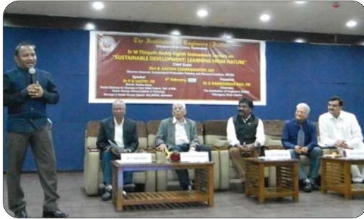
The Chief Guest addressing the gathering