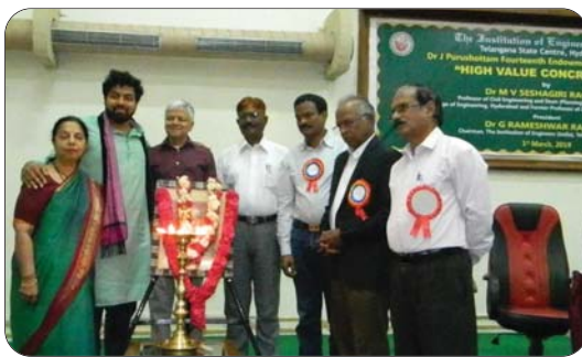
The Chief Guest lighting the lamp and dignitaries presented